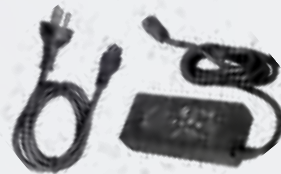
Power Adapter for Portable Repeater PS7502