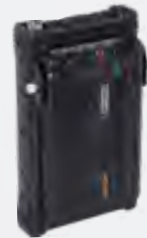
Power Management System PV3001