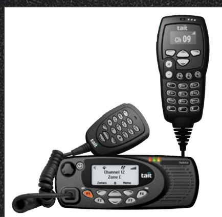
TAIT AXIOM Mobile provides a choice of vehicle installation and user interface options.