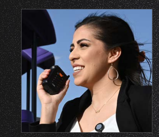
Compact, ruggedized, wearable broadband communications device for heads up operation.