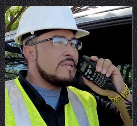
Intelligent vehicle network and edge computing platform in a familiar radio form factor.