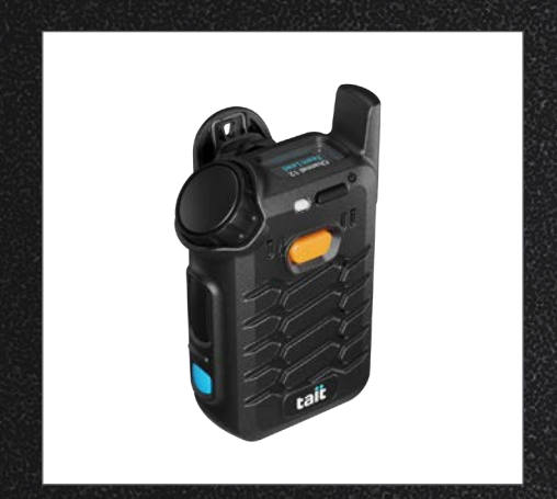
TAIT AXIOM Wearable is a compact, ruggedized, device for heads up communication.