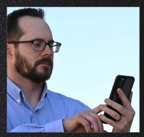
Broadband smart devices can bridge the gap between networks, devices and user locations.